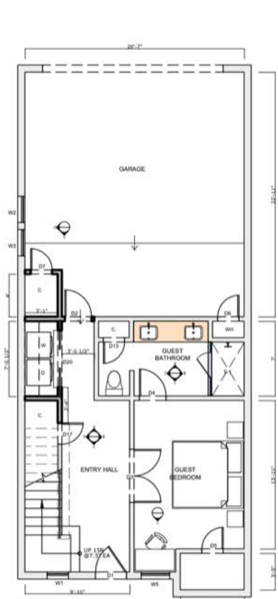
Level 1 GARAGE: 478 SF GROUND FLOOR: 889 SF